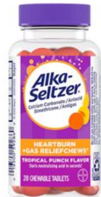
Calcium Carbonate Simethicone