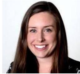
Jade Adams Supply